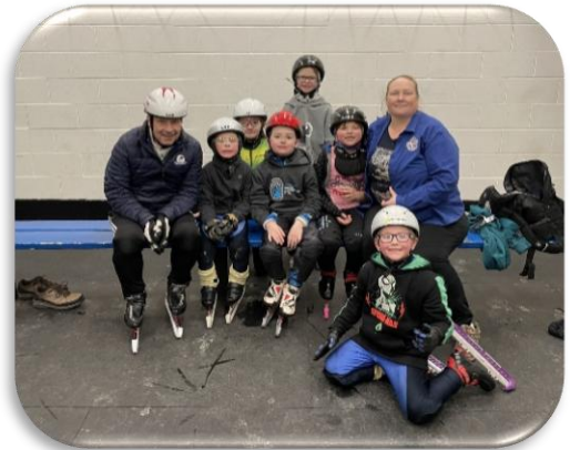
Moose Jaw Speedskating $1000 to go towards a new mat for the rink Protection that is required and in need of replacement.