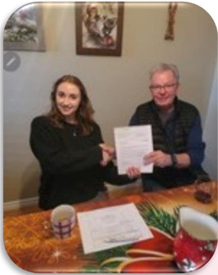
Calgary North Council 1015 donates $4,000 to T+T Trampoline Club