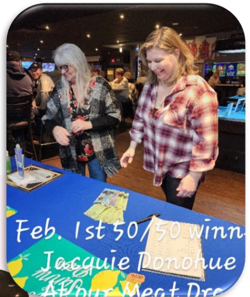
Medicine Hat 1020 having fun at their Saturday meet draws in Medicine Hat.