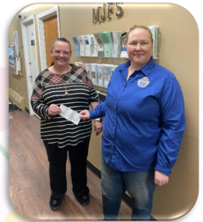
Moose Jaw Council 1027 Donating $1500 to Moose Jaws Family Services Food programs.