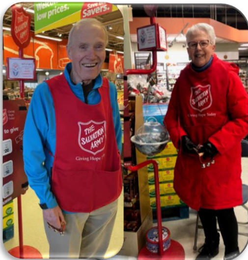
St. Albert council 1024 rang the bells for the Salvation Army $ collecting 13 purses for the "Fill the Purse" initiative by donating a new or slightly used purse for the Salvation Army Christmas Toy Store.

Congratulations to all Members and St. Albert Council #1024