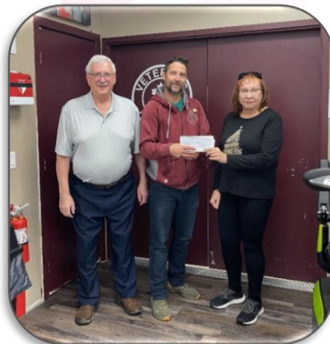
Calgary council 1015 presenting a cheque for $10,000 to the Veterans Food Banks.