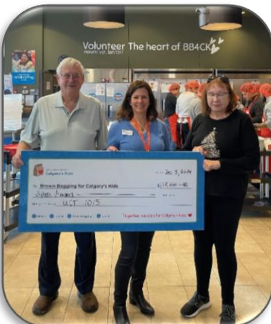
Calgary Council presenting a cheque for $15,000 to Brown Bagging For Calgary Kids in Calgary