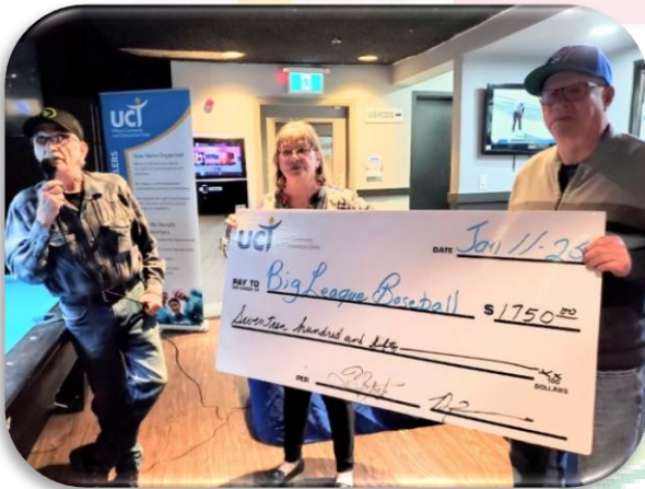
Medicine Hat 1020 Donating $1,750 to Big League Baseball League of Medicine Hat.