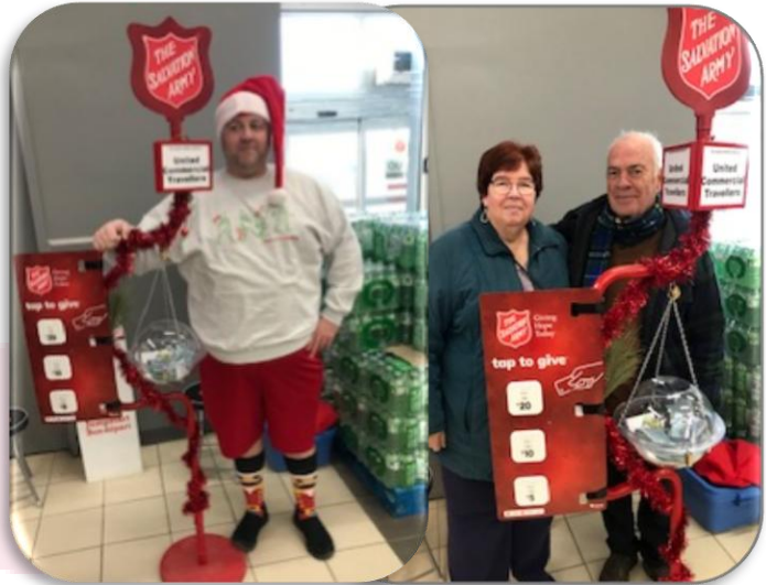
"UCT 1039 has manned a Salvation Army Kettle for many years now, and every Christmas, we are happy to assist as they break their goal of more than $300,000.00."