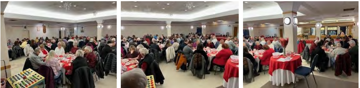
Above it took 3 shots to fit all 150 guests in pics