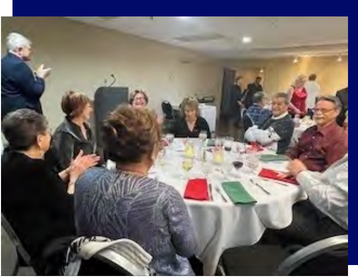
A.C.T. Edmonton S. Club 1017 Annual Xmas Party. Fun was had by all