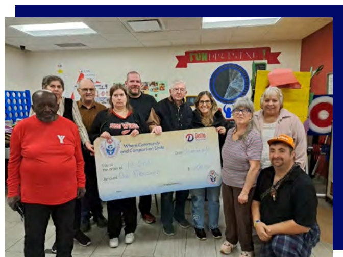
Sudbury Council #1051 making a donation of $1,000 to Independent Living Sudbury Manitoulin.