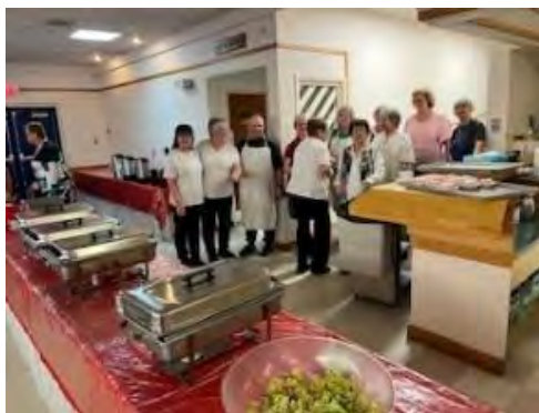
The Ladies Axillary Branch 5 did up a fabulous supper,, AGAIN, Thank you