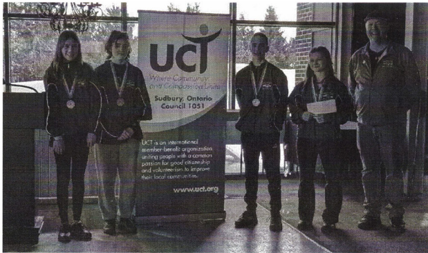
The happy winners!

We are always looking for ways to make our meetings interesting and welcoming. If you have any ideas on how to make the meetings exciting, please share them with us. You can send ideas to me at zwarichc@gmail.com or to anyone on the executive.